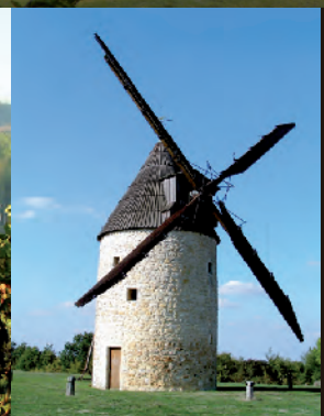
Moulin de Moussaron