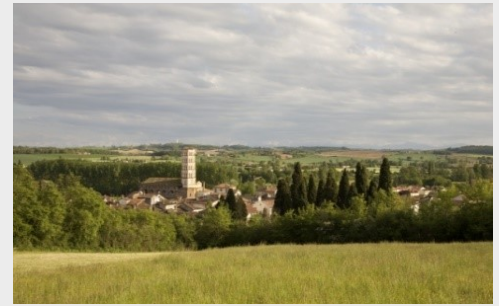
Lombez, view from Saint Majan