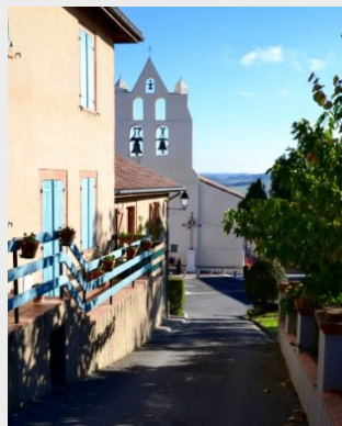
Saint-Amat's Church in Sauveterre.