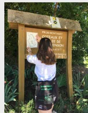
Starting point for the PR26 hike in Montamat.