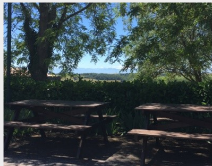
Picnic tables with view of the Pyrenees in Montamat

Tél : + 33 (0)5 62 62 55 40 contact@tourisme-saves.com www.tourisme-saves.com