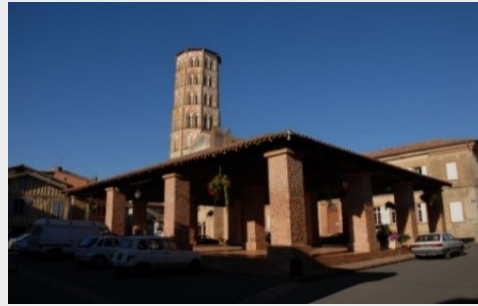
Lombez historical centre, Sainte Marie's cathedral