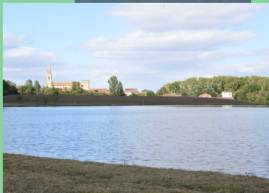
Outdoor leisure centre in Saramon