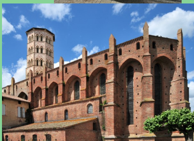
Sainte Marie's Cathedral in Lombez