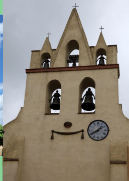
Saint Barthélémy's church in Monblanc