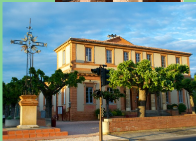
The town hall in Lombez