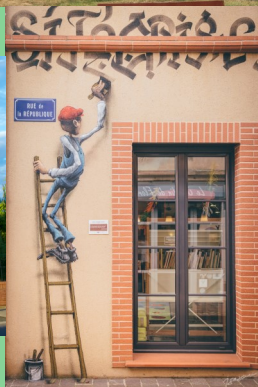
Street Art in Lombez