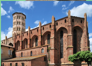
Sainte Marie's Cathedral in Lombez