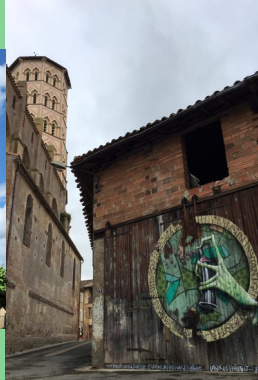
Street Art in Lombez